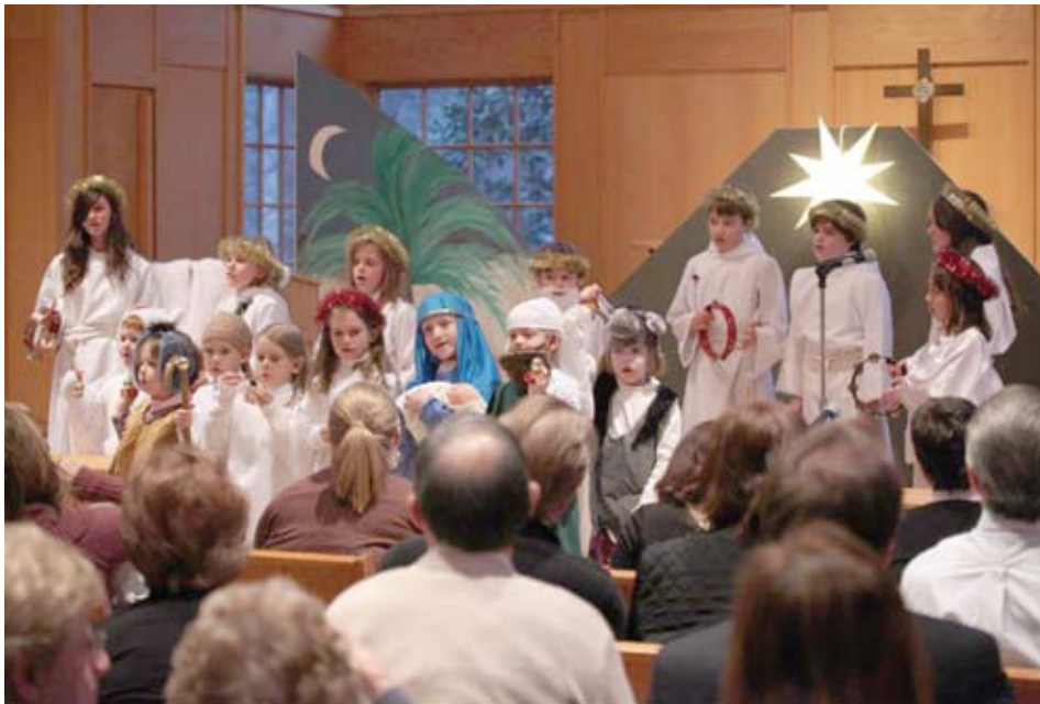
Angels Aware Christmas Pageant on December 18, 2011. See more photos on page 4